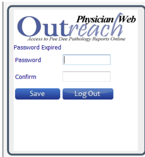
Expired Password Window